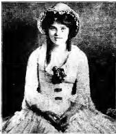
She is happy in speaking in "Not So Long Ago" in the South Street, New York.