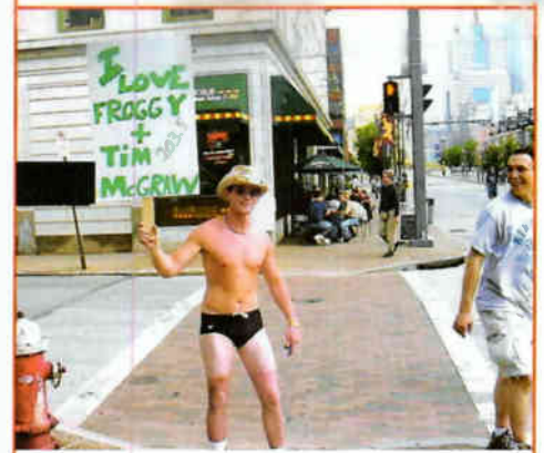
This listener of WOGI (Froggy) Pittsburgh was brave enough to put on a Speedo and carry a sign through downtown Pittsburgh in an attempt to win a pair of Tim McGraw concert tickets.