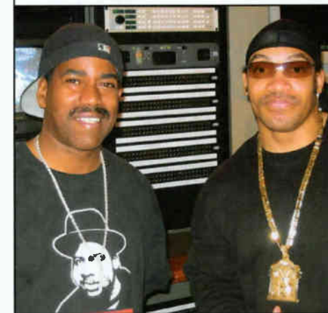
A pair of hip-hop pioneers reunited at Sirius' New York headquarters when on-air host Kurtis Blow, left, interviewed Melle Mel (aka Grandmaster Melle Mel) for his weeknight show on classic rap channel BackSpin.

should be involved and when it should not."