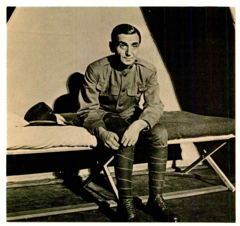
"A patriotic song is an emotion, and you must not embarrass an audience with it or they'll hate your guts. It has to be right, and the time for it has to be right."

good for the user of music as it is for the writers and publishers; it is a constantly replenishing reservoir that never runs dry or can be permitted to run dry."