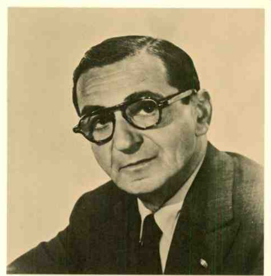
"The main thing is to write and keep writing. You write in the morning, you write at night, you write in a taxi, in the bathtub or in an elevator. And after the song is all finished, it may turn out to be very bad – but you sharpen your pencil and try again. A professional song writer has his mind on his job all the time."

Modest? Whether we like it or not, there are comparatively few creative