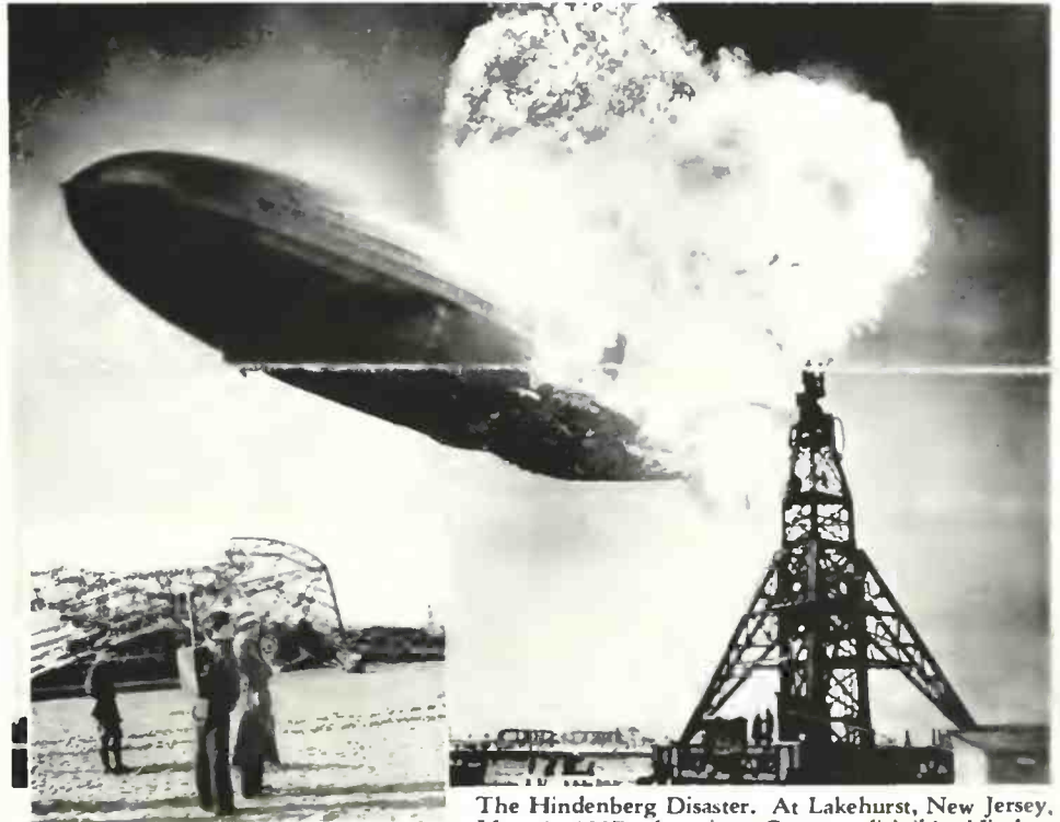
The Hindenburg Disaster. At Lakehurst, New Jersey, May 6, 1937, the giant German dirigible Hindenburg exploded killing thirty-six persons. On the spot, describing the most tragic accident in commercial aviation's history, was a horror-stricken, half-crying radio announcer, sent from a Chicago station to record the landing of the huge ship. These recordings, broadcast later, shocked a spell-bound nation.