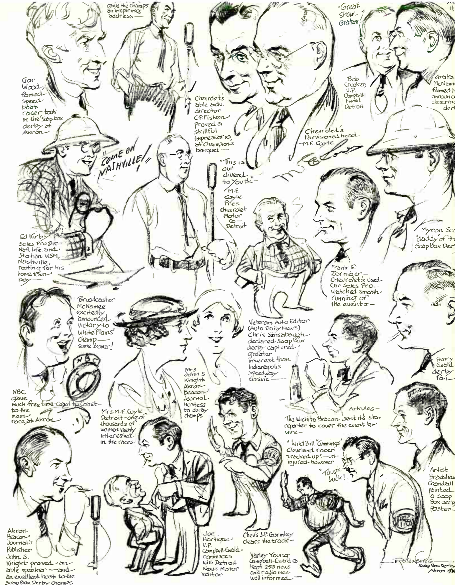
Gar Wood, famed speed boat racer, took in the Soap Box Derby at Akron

And were there any skeptics in the (Turn to page 37)