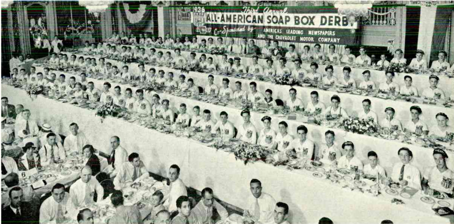
The Banquet of Champions (Wheatena could use this art!) 117 boys who did honor to the newspapers backing their craftsmanship efforts, received many awards at the hands of their sponsoring newspapers and Chevrolet Motor Co. The boys are seated in four balcony tiers in the massive banquet hall of the Mayflower Hotel at Akron. (Aug. 16)