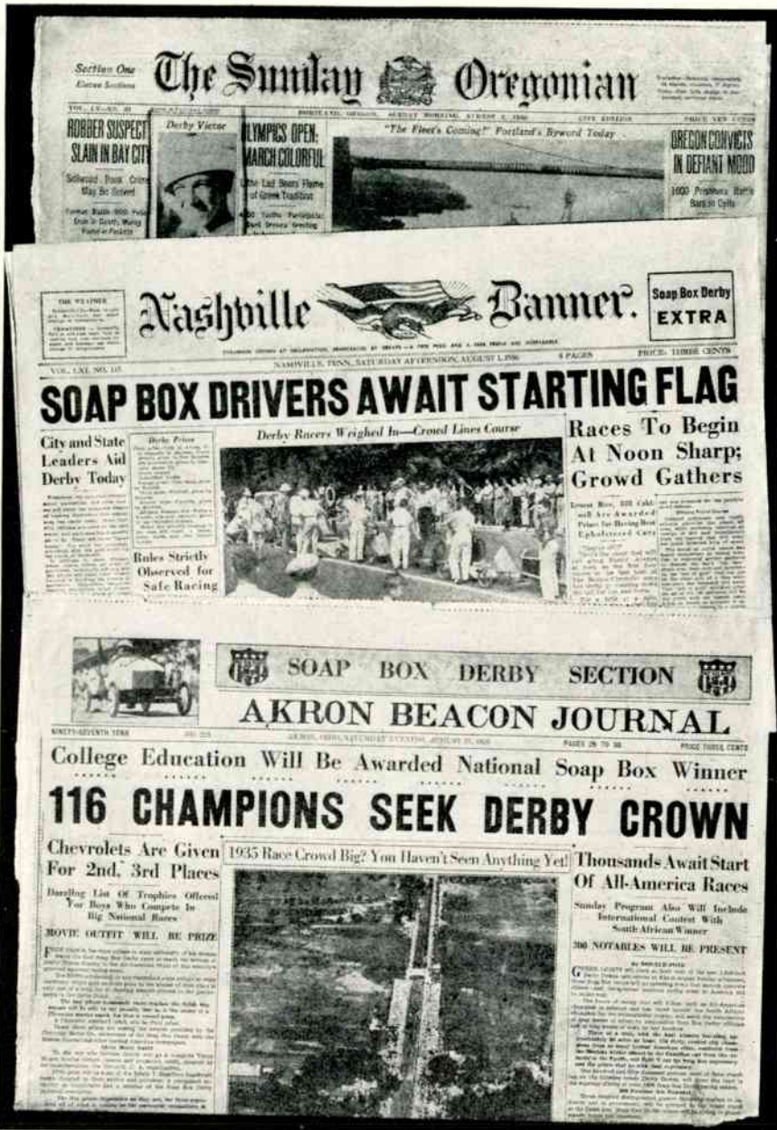
The 116 newspapers in the Soap-Box Derby contest, as evidenced above, gave this circulation-building feature very ample play; many devoting special advertisement filled editions to it, in highlighted with 7-column feature headlines.

programs in the world, and the Soap Box Derby is backed nationally by his company. In 116 cities leading newspapers sponsor and conduct the sectional finals to find the champions who compete for national and world honors at Akron.