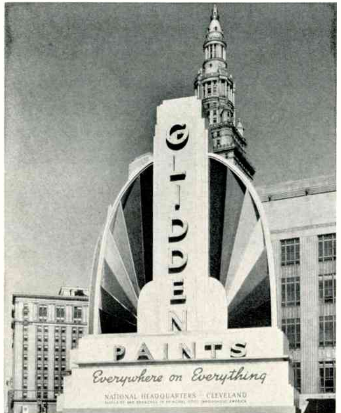
Mammoth colorful spectacular erected at Cleveland by the Central Outdoor Advertising Co., to advertise Glidden Paints. In the background is seen the Cleveland Hotel, Cleveland Terminal Tower, and the new Cleveland Post Office. This initial outdoor effort of the Glidden Co. is ten stories high.

the wide diversification of The Glidden Company.