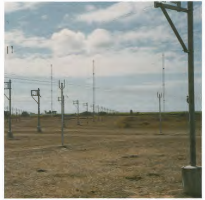
Transmission lines with curtain support structures in background.