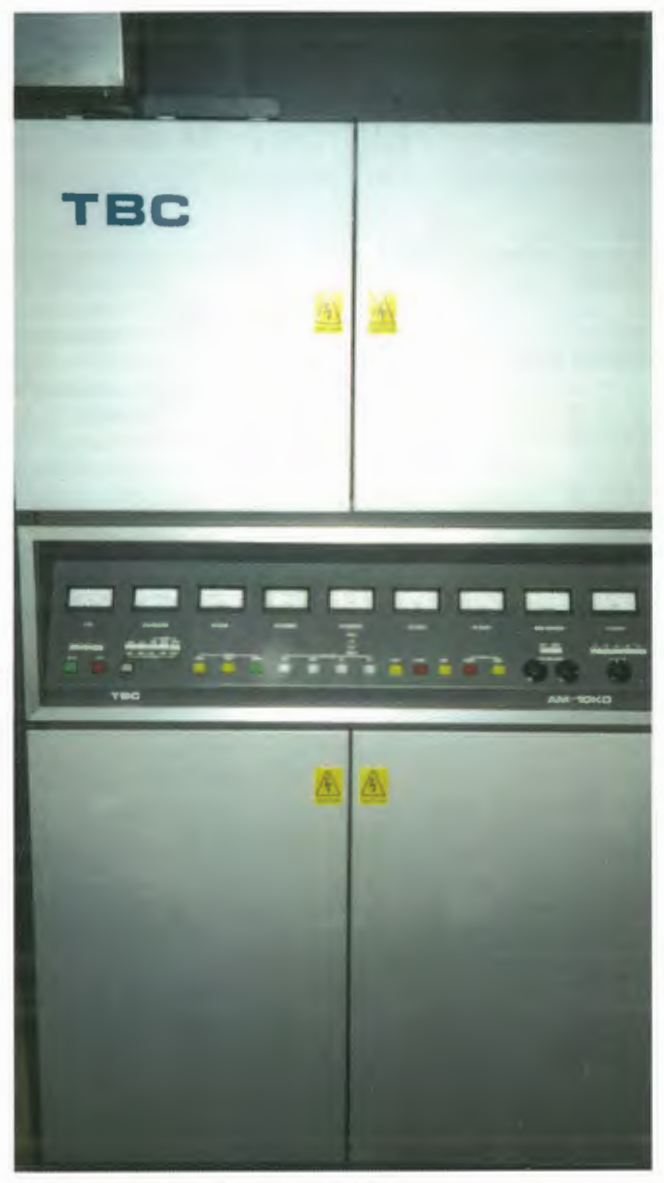
Main transmitter TBC type AM10KD.