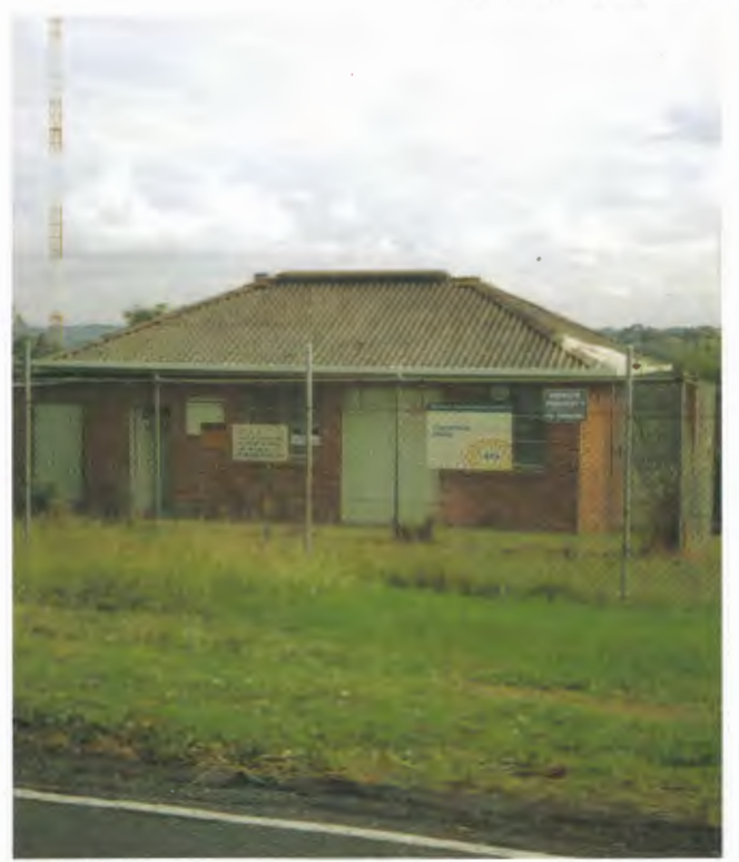
Transmitter building. Power room on left of building.