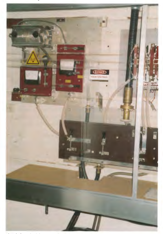
Aerial switching equipment.