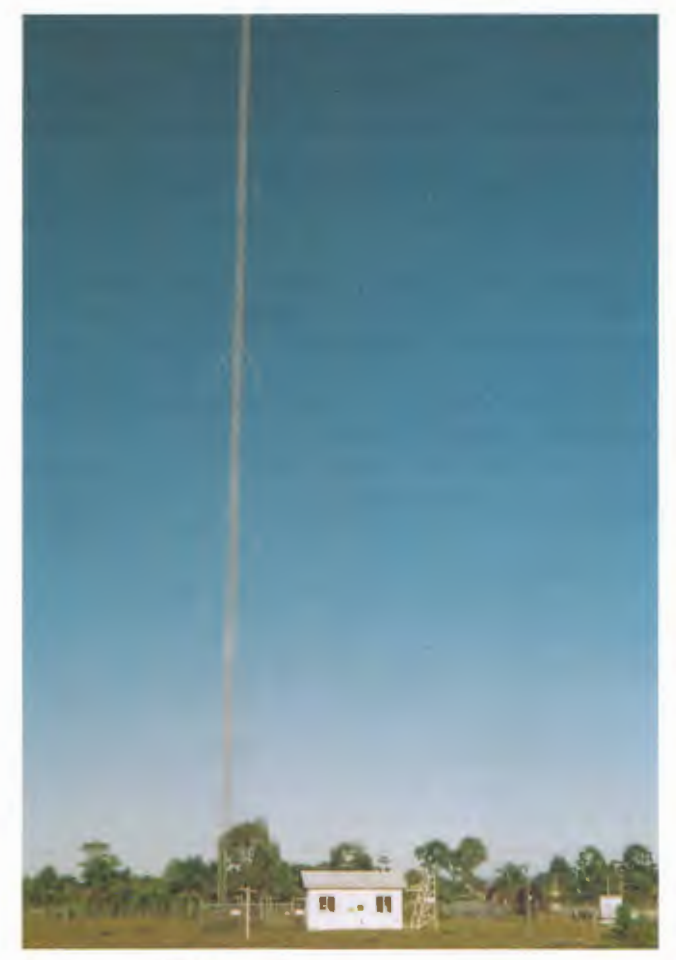
Radiator and ACU building.