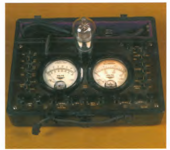
Serviceman's test instrument.

specialised test equipment but the reliability of receivers is greater than it was in the earlier days of broadcasting. The author of a book on radio servicing published in 1927 summed up the position in those days as follows:-