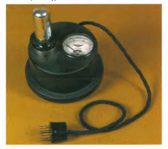
Test unit for 199 type tube.

were necessary for tube operation. Three different types were required and were designated A, B and C types.