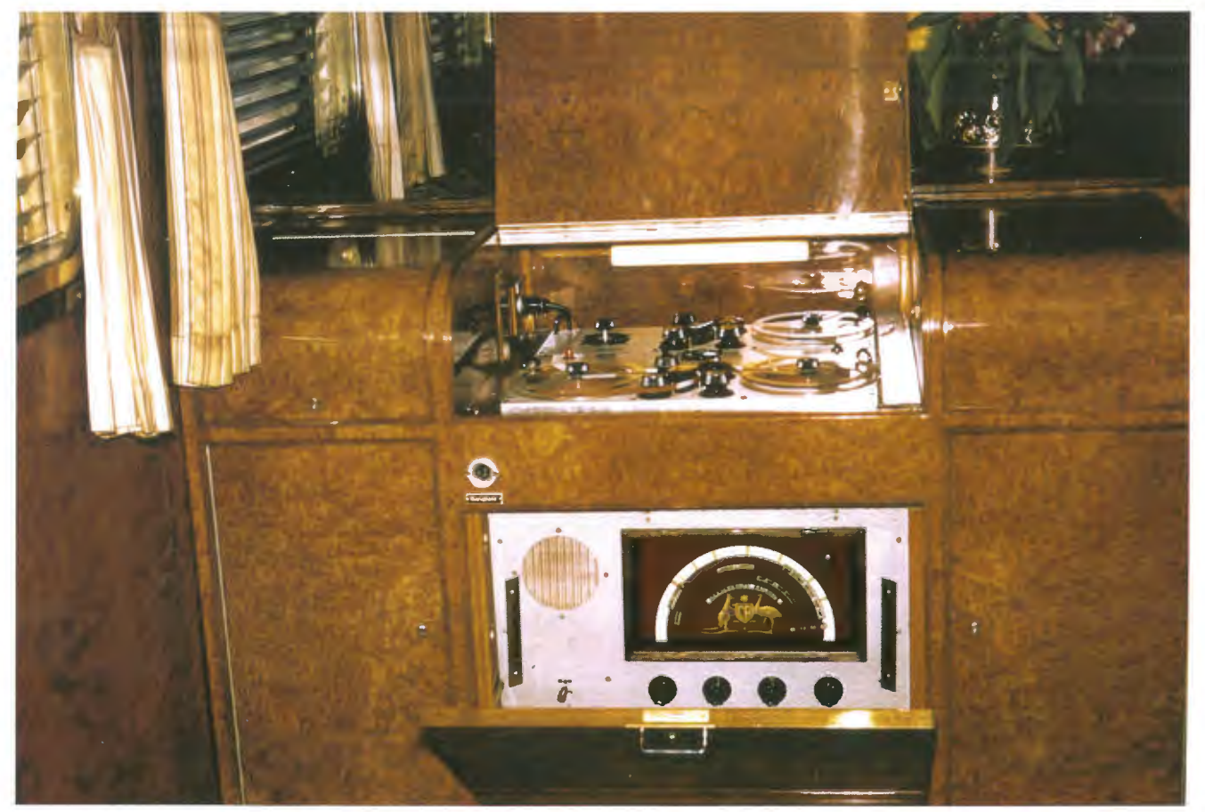
Broadcast receiver and tape deck in lounge car.