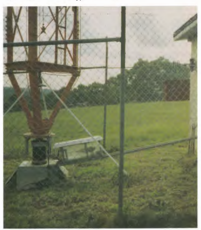
Main 135m radiator showing base insulator and grounding system.