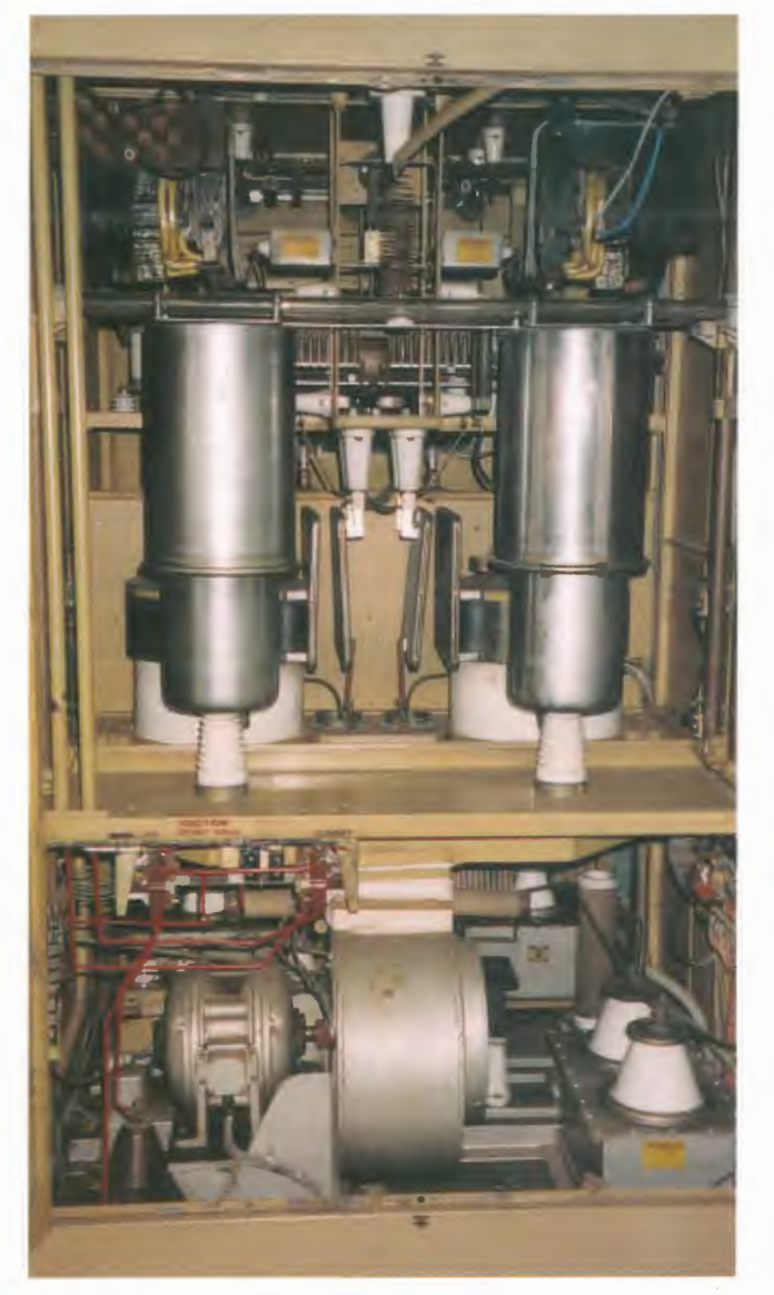
Rear of power amplifier cabinet.