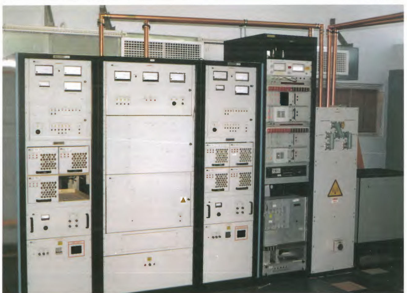
The new 6DL Nautel transmitter installation.