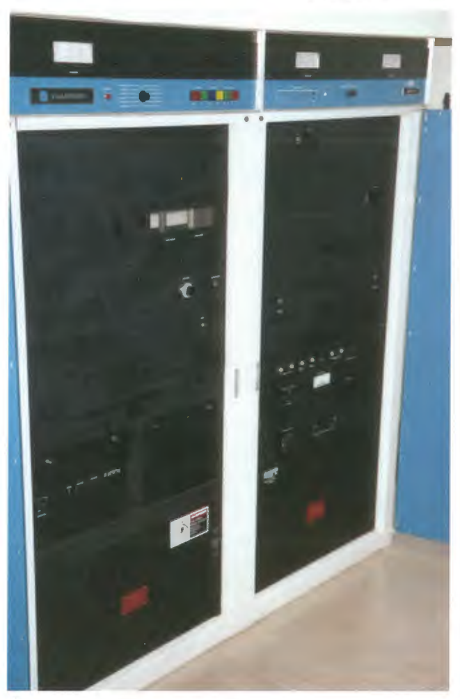
One of a pair of Harris 10 kW transmitters derated to 5 kW.