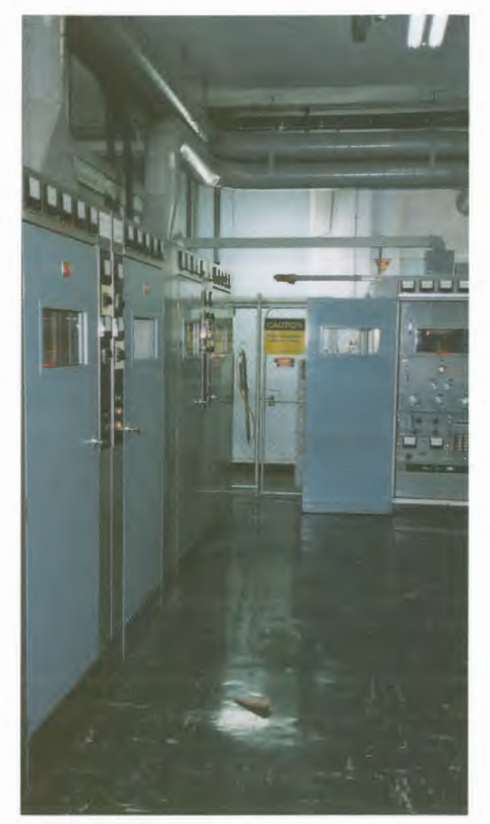
Transmitter hall with three 10 kW transmitters.