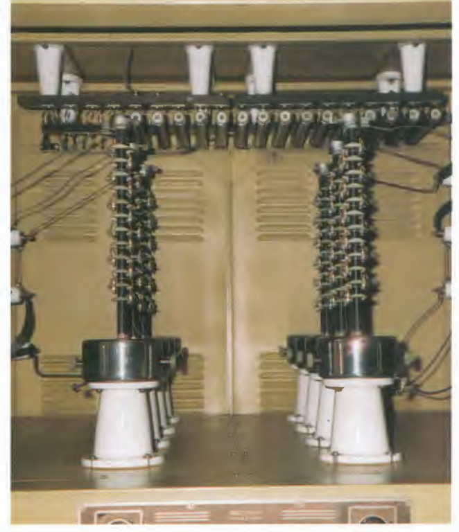
EHT rectifier stacks.