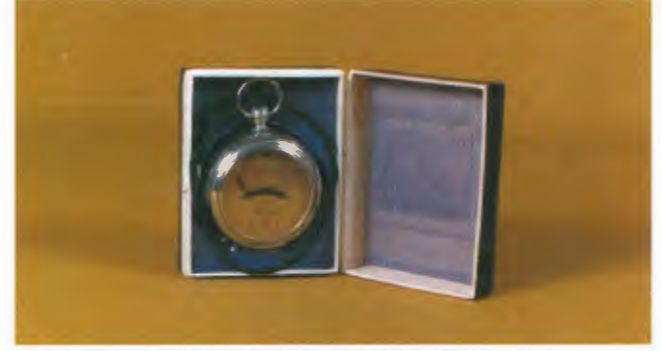
Watch or pocket type voltmeter.

Receivers fully powered by the electric mains did not filter into homes until about 1929, so before that batteries