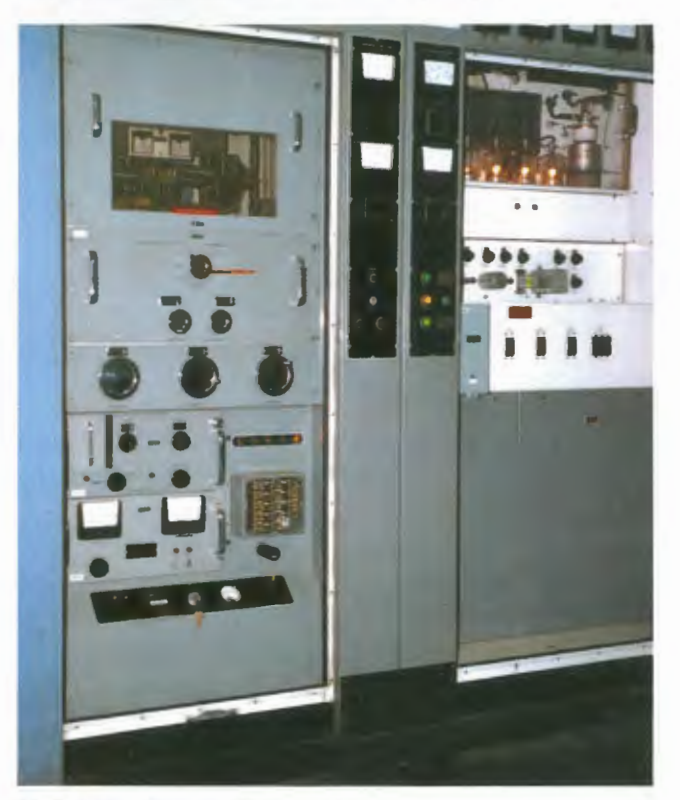
STC 4-SU-48B 10 kW transmitter.