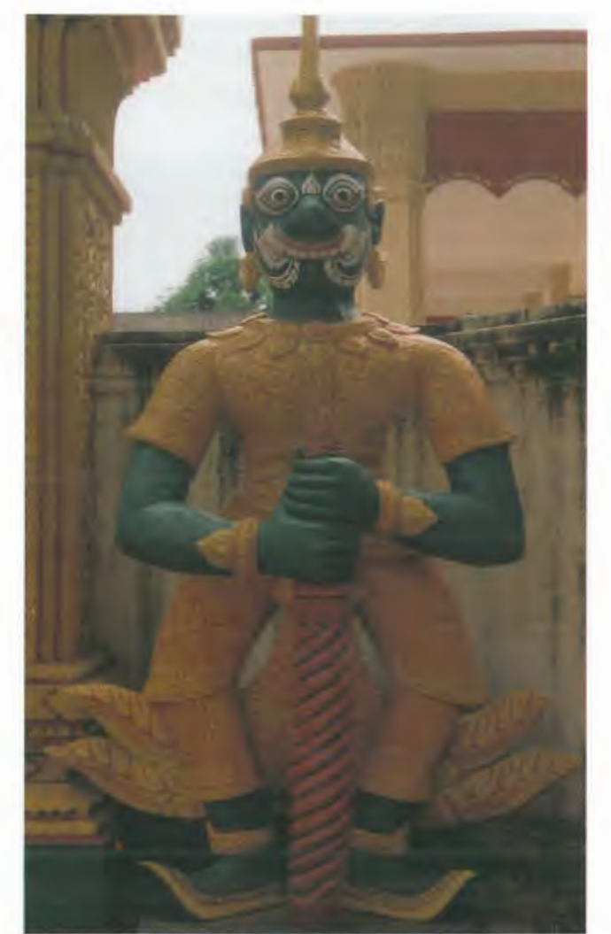
Statue Outside Wat Mixai-Vientiane.

Program Input Equipment in Control Room.