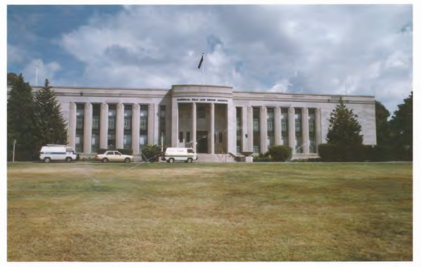
National Film and Sound Archive building Canberra.