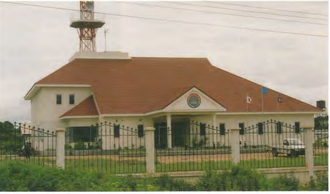
Lao National TV Studios-Vientiane.