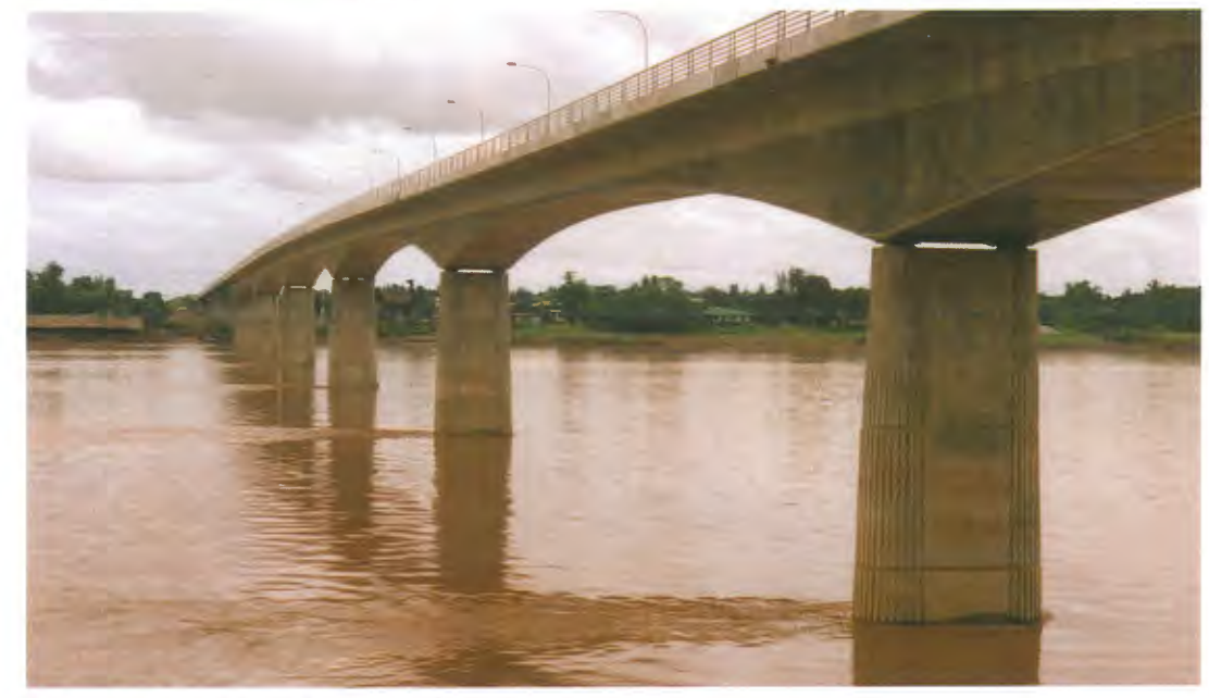
Friendship bridge across Mekong River.