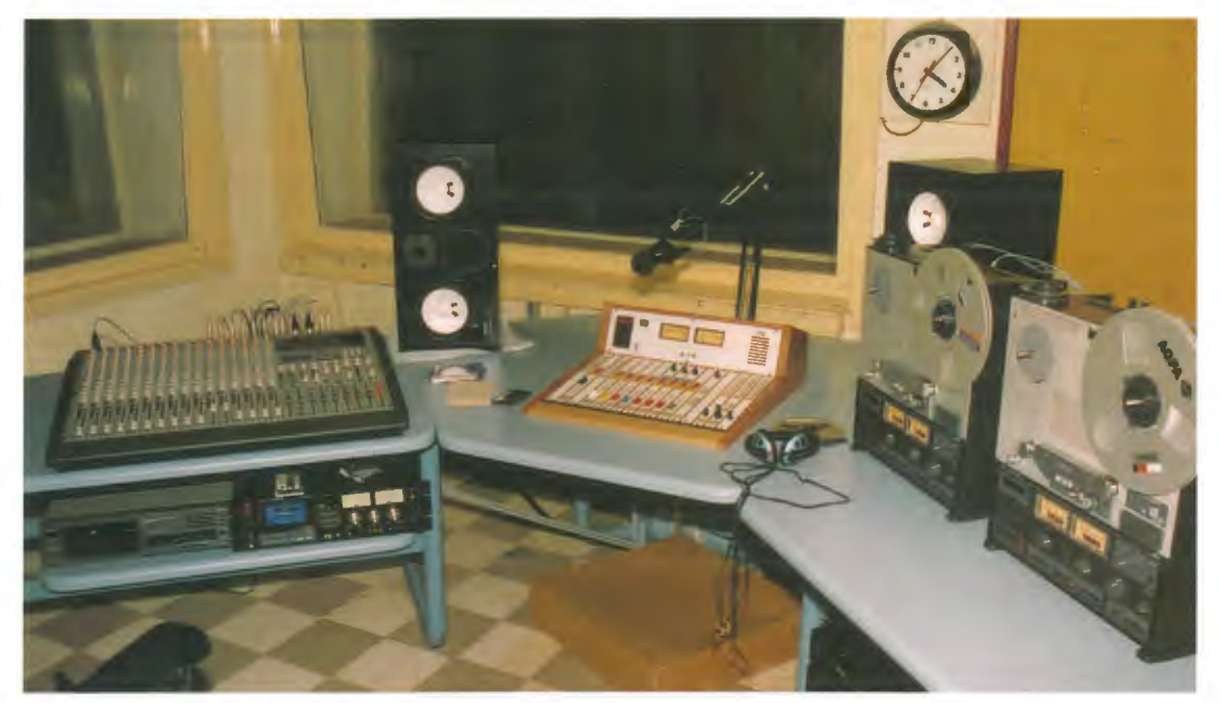
Lao National Radio Studio-Vientiane.