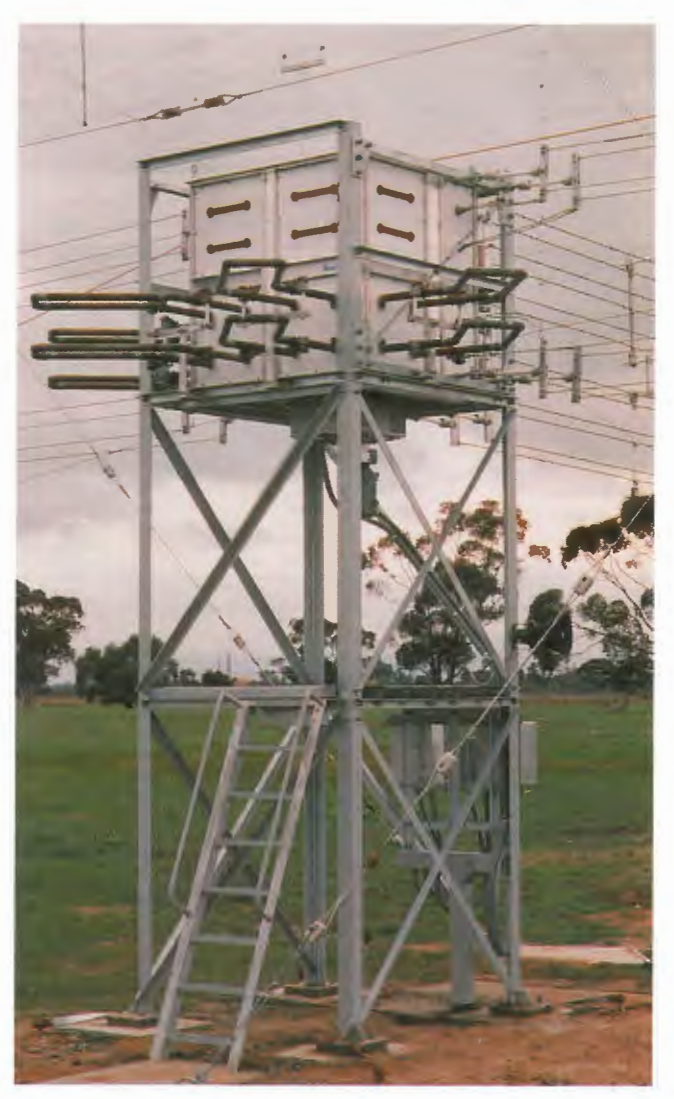
One of the three slewing switches.

The six masts and transmission line poles were erected under contract by EPT. Two of the masts were ex-Radio Australia, Cox Peninsula, and were upgraded by replacing