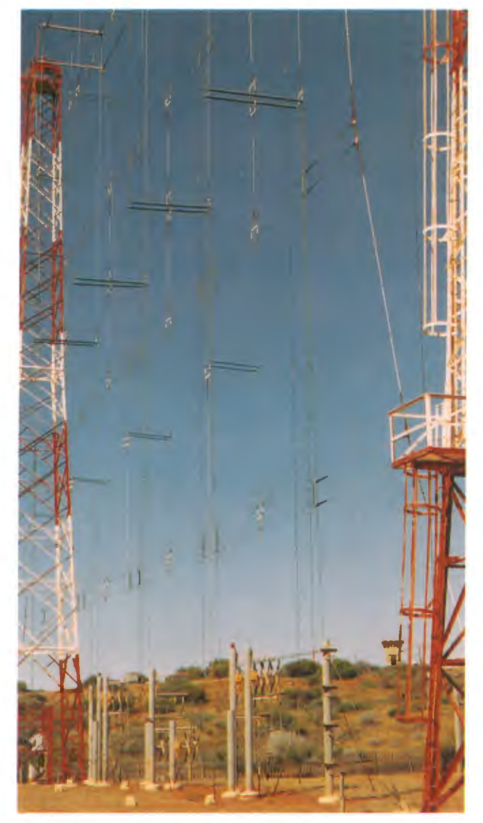
One of the four by four antenna curtains.

The antennas cover the bands 6, 7, 9 MHz; 7, 9, 11 MHz; 11, 15, 17 MHz and 15, 17, 21 MHz.