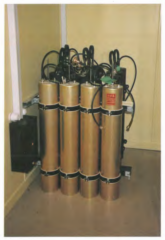
100 watt combiner installation Gladstone TAB service.