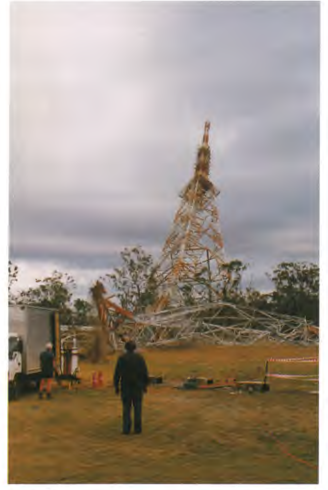
Tower disappearing over mountain side.

After extensive analysis of a number of upgrading proposals, it was concluded that it would be more economical to construct a new tower to accommodate all of the Band 2, Band 3 and UHF services required for Equalisation at this site. Consequently, after commissioning the new tower and cutting across all services, the original tower was to be removed.