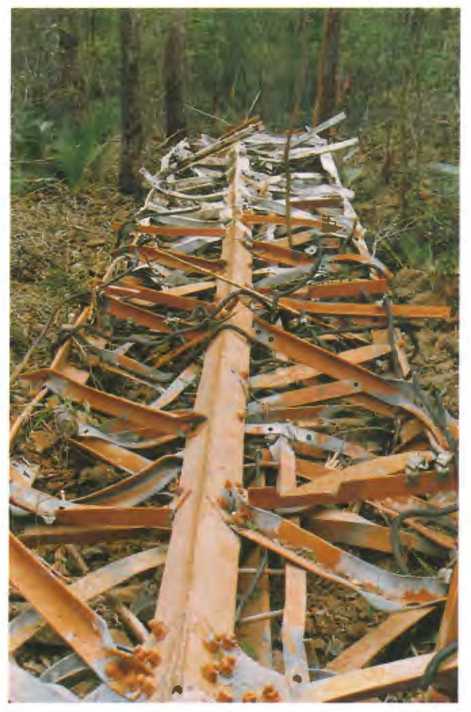
Band 3 column on the ground.

The demolition method allowed the collapse initiation to be fully controlled. The tower behaved as predicted, landing on the