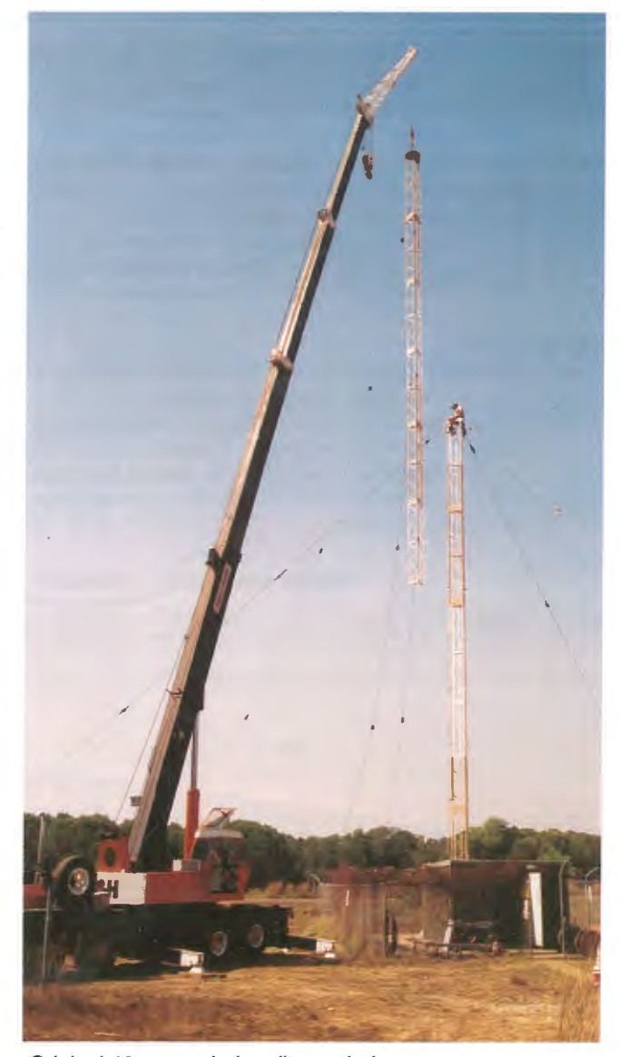
Original 40m mast being dismantled.

Inside the transmitter building, changes will be necessary to accommodate new solid state transmitters for both services. For Radio National, decision was made to stay with the previously established policy of using two transmitters always 'on' and operating in parallel mode. On the other hand, the NT Racing Commission who are the providers of the 8TAB program have opted for a single transmitter running at slightly under maximum power capacity.