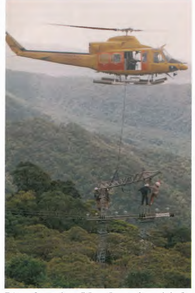
Telecom Construction staff dismantling part of transmission line tower as helicopter prepares to lift away a section.

Access to the site is gained by means of an N.T.A. owned cable way 5.4 km in length with passenger car