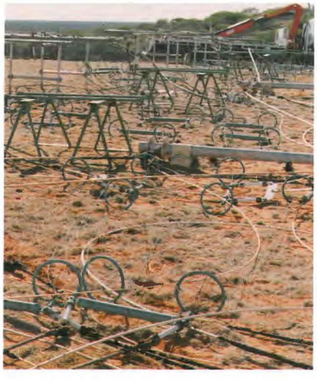
Antenna lowered to ground for maintenance.