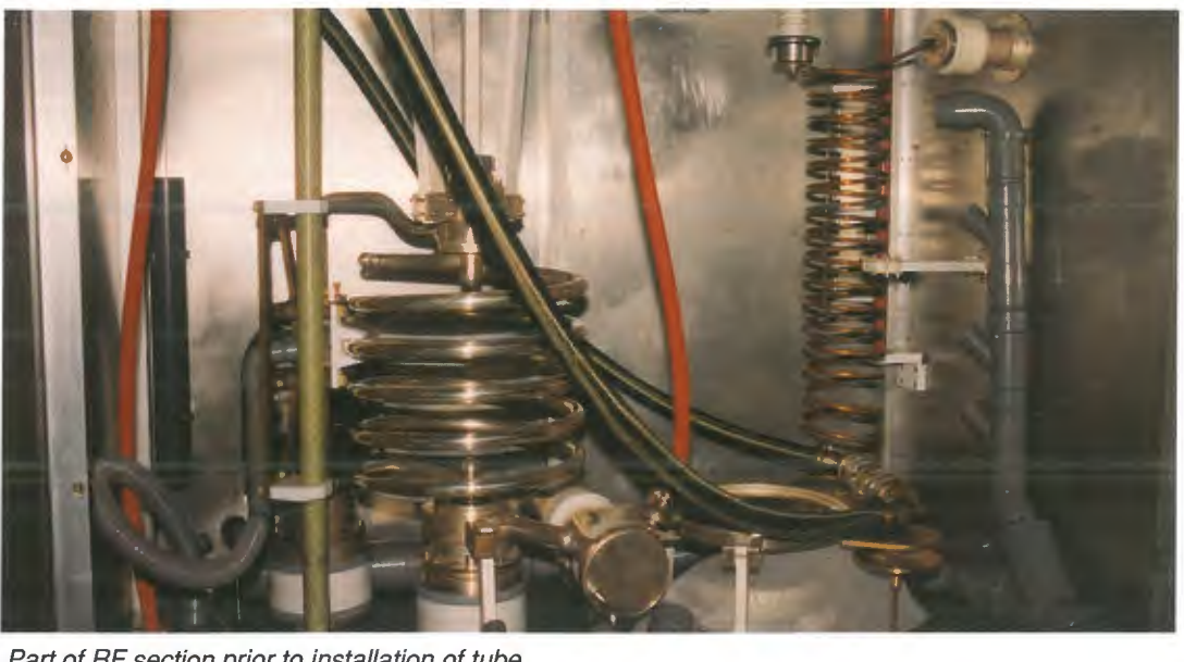
Part of RF section prior to installation of tube.

The mains power supply requirement is 3 phase 400 V and the transmitter has a 50 ohm unbalanced output. On site, the transmitter is supplied with a balun to convert the output to 300 ohms symmetrical to suit the existing balanced transmission lines and antenna selector matrix switch.