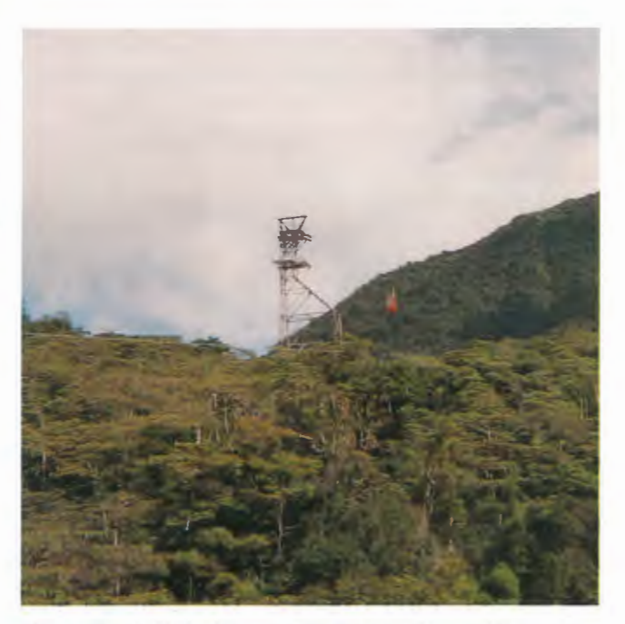
View of the access cableway with the red cable car in transit.