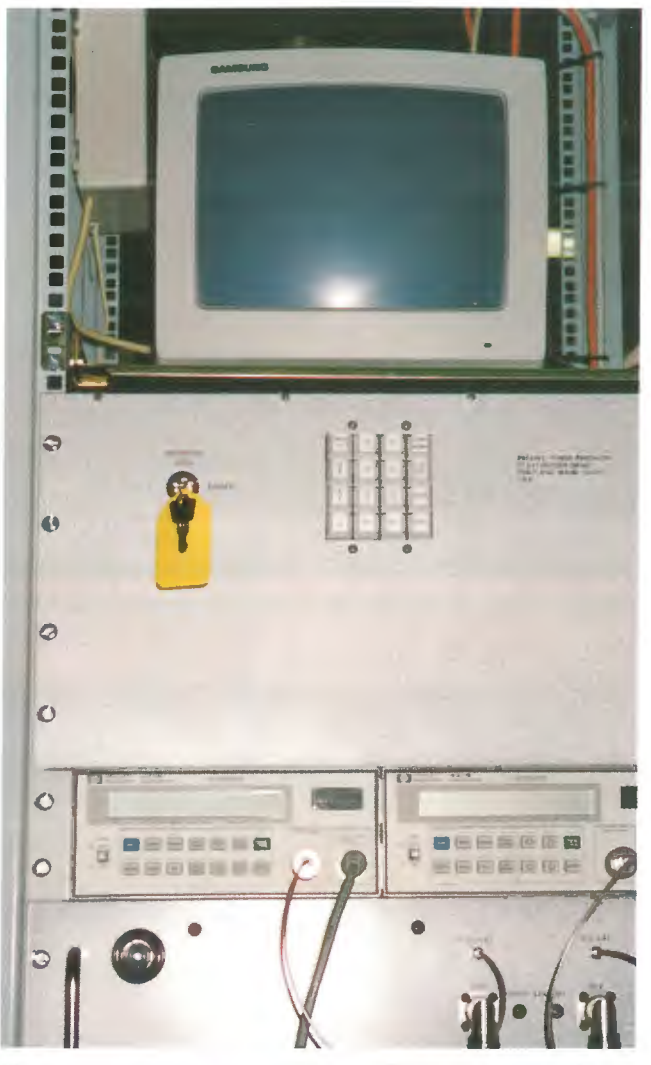
PPP monitoring and control system Black Mountain, ACT.