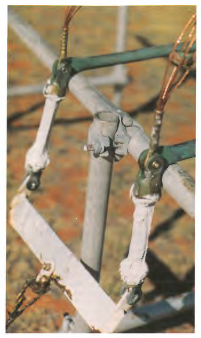
Insulators coated with high voltage silicon grease compound.

small arc, continually flexing. Before fatigue sets in, the sections of rope in the vicinity of the pulley must be moved to a new non-flexing position. This is achieved by cropping the end of the winch rope at the point of attachment to the antenna structure. Because of the size of the rope, tools powerful enough to crimp the terminations are not available in the field. The practice adopted to terminate the rope is hand splicing. An alternative method of terminating ropes is being investigated using epoxy resin compounds to avoid the cost of bringing experts from Perth for the splicing.