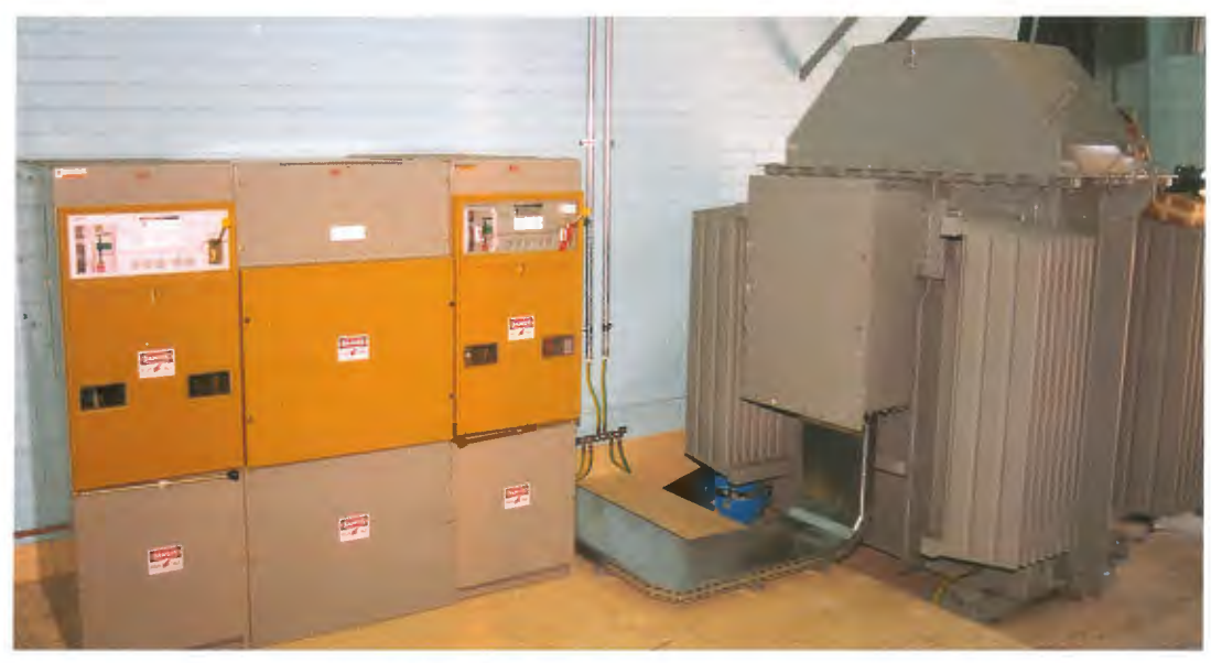
11kV switchgear and 11kV/400V step-down transformer.

A video colour display module is incorporated in the transmitter control panel which indicates the transmitter status. Alarm messages appear as part of the display. Alarm events are logged in the controller memory and can be scrolled through for maintenance purposes. In the event of a fault, plain language messages are displayed in conjunction with faults to assist in fault resolution.