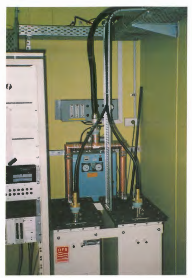
500 watt combiner Blackwater TAB service.