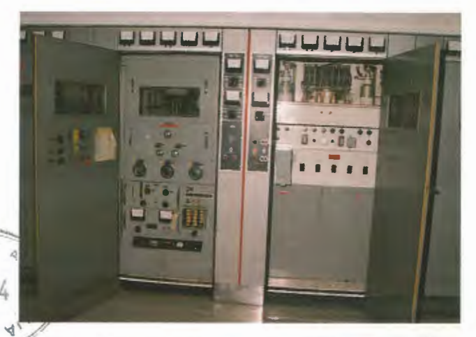
VLW main 6 and 9 MHz aerial systems.

DEREK PROSSER/LLOYD JURY VLW 10kW, 6 and 9 MHz transmitter, STC type 4-SU-48B.