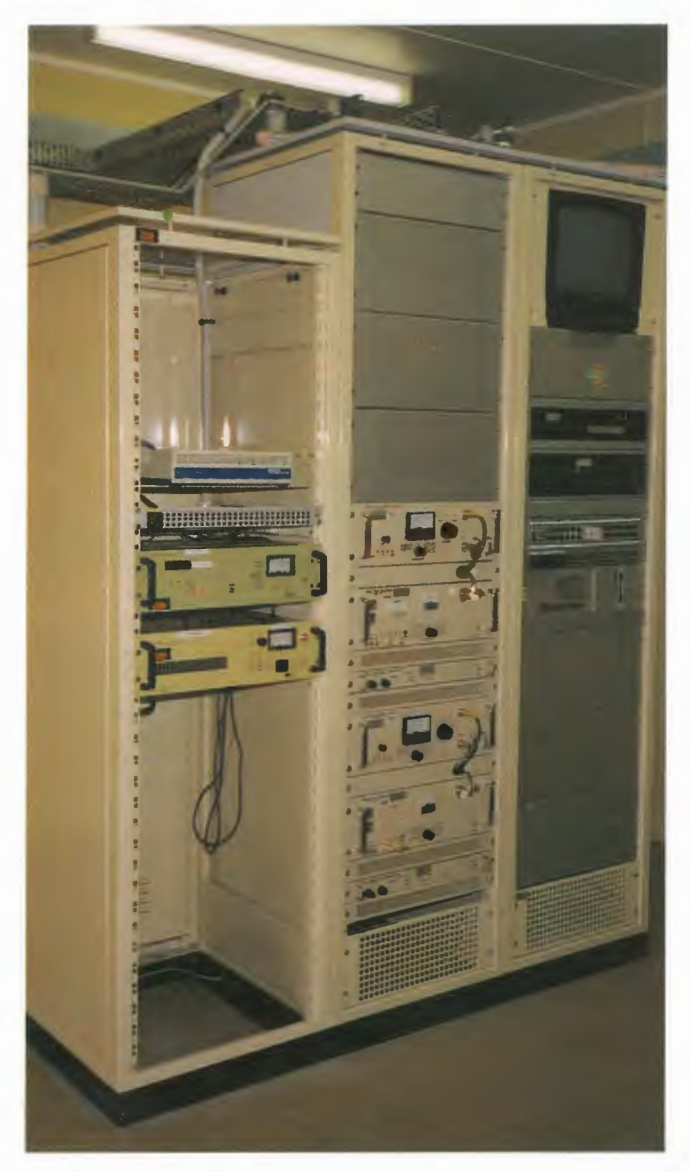
TAB FM transmitter installation Gladstone.