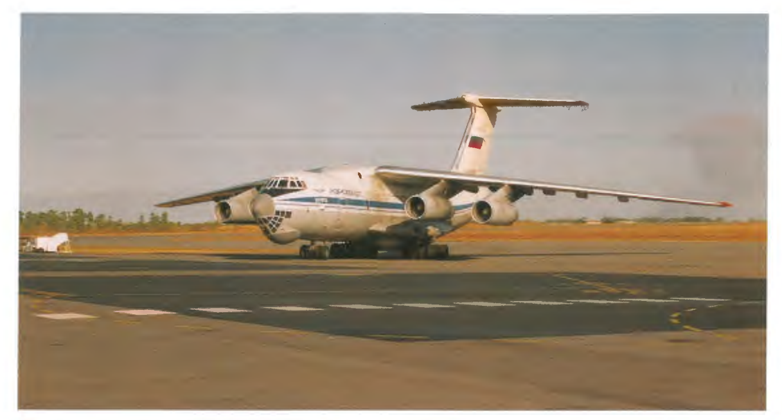
Russian cargo plane carrying transmitter, Darwin airport.