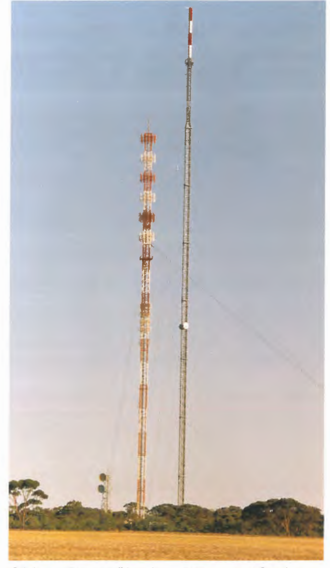
Original 152m mast (L) and new 202m mast at Goschen.

As the UHF antenna broadcasts a number of services