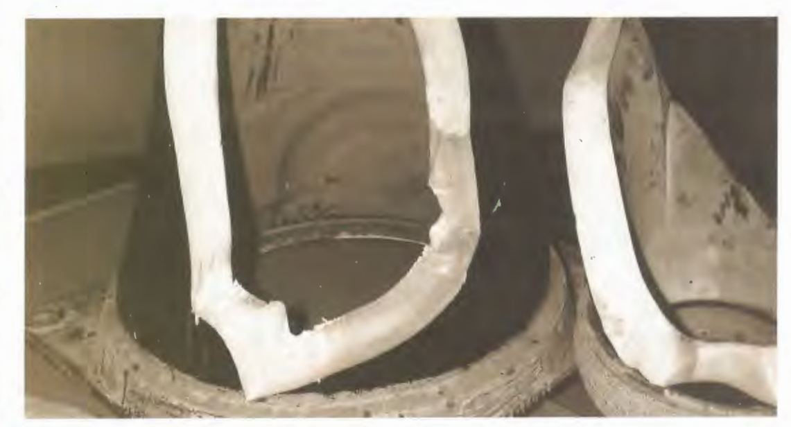
Damaged armature support insulator 4QG/4QR Bald Hills due to lightning stroke.