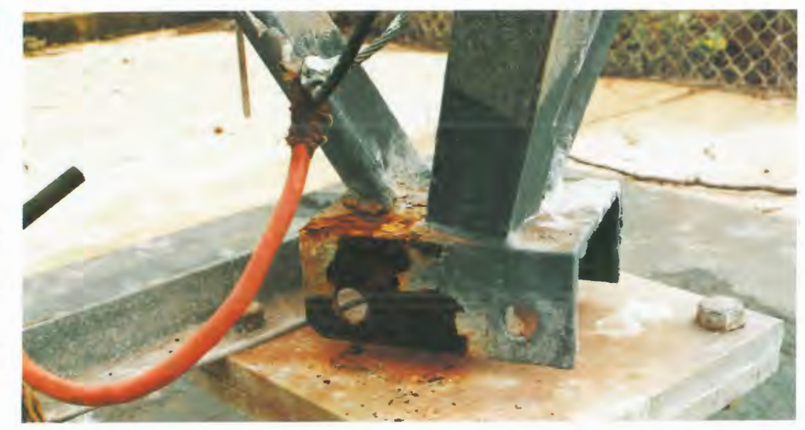
Mast base corrosion 8GO Nhulunbuy.