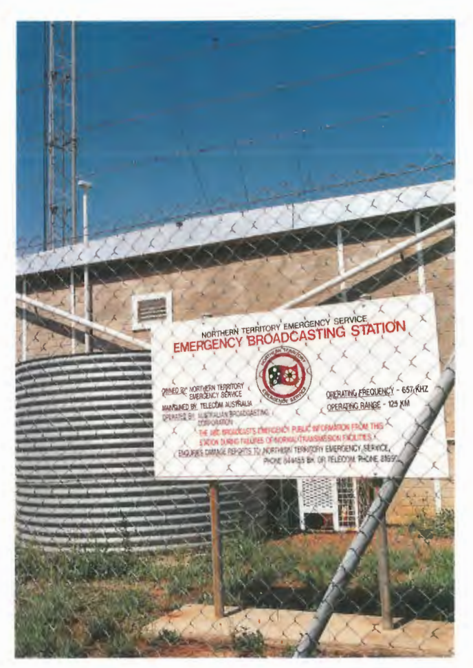
The station building and sign.

The facility was commissioned by PMG Broadcasting staff in November 1968 and comprises an AWA BTM 2M 2.5 kW transmitter, associated program input equipment, a 60 metre radiator and self contained 15 kVA diesel generating plant. The station is fitted out to operate on 657 kHz the same frequency as the NBS station 8DR in Darwin. It is frequently used as an emergency back-up for 8DR and is connected into the ABC network via a UHF radio link.