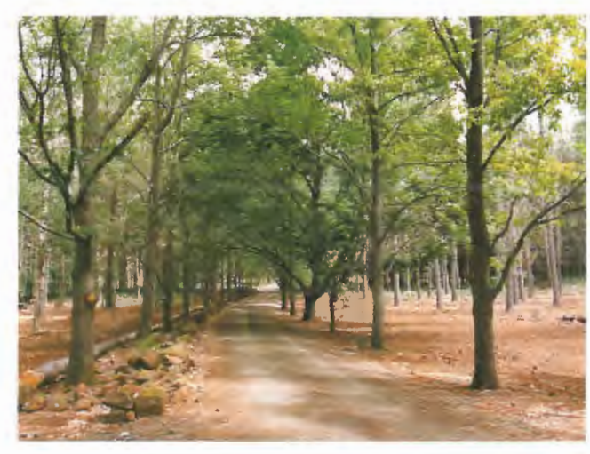
Trees planted to provide wood for tennis racquets.

The station is situated in the central northern area of Tasmania and the service area covers the north-eastern region of the State including Launceston and the Tamar Valley. There is a large plain in the Tamar rift valley which stretches from the north-eastern edge of the central plateau to the drowned inlet of the Tamar estuary and Port Sorell.