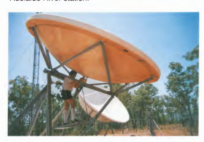
TO1 Dave Edwards inspecting LNC at Nhulunbuy site.