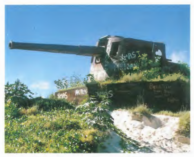
Reminder of the War.