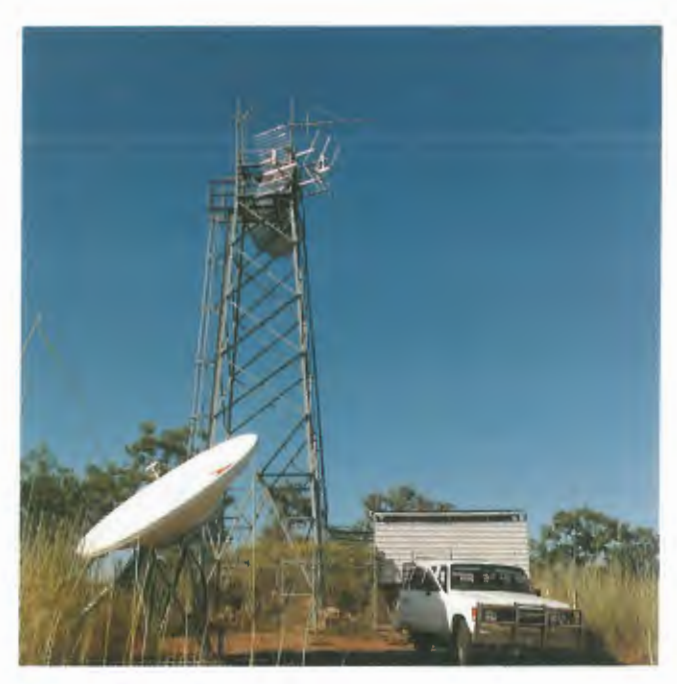
Adelaide River station.