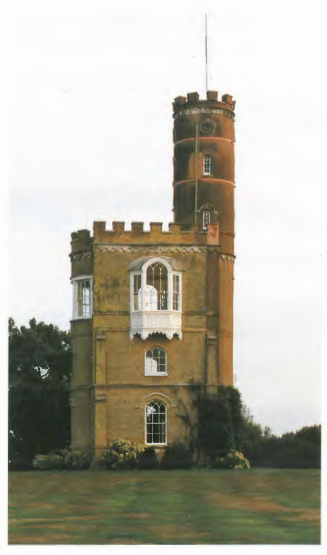
Luttrel's Tower. Built 1730. From here Marconi conducted wireless telegraphy experiments