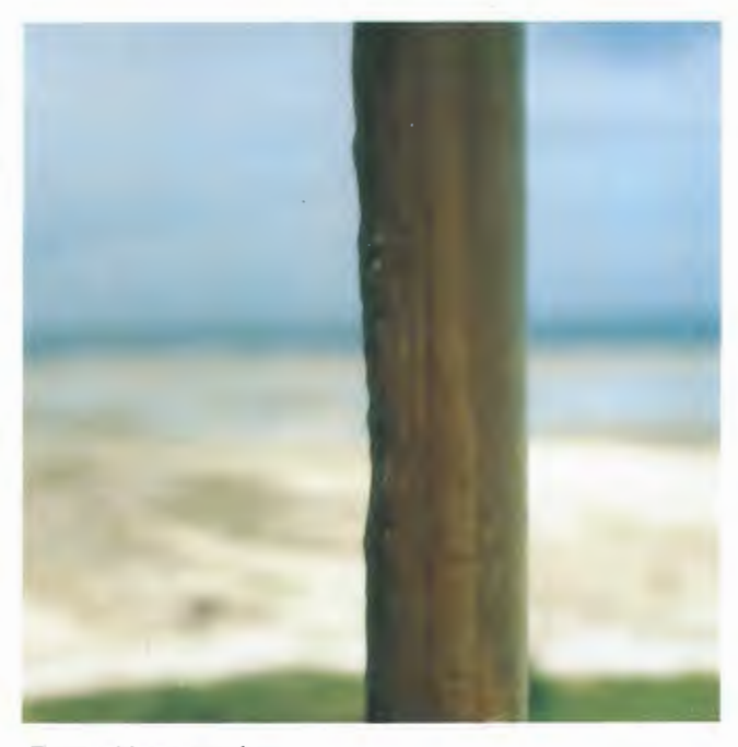
Rusted leg member.