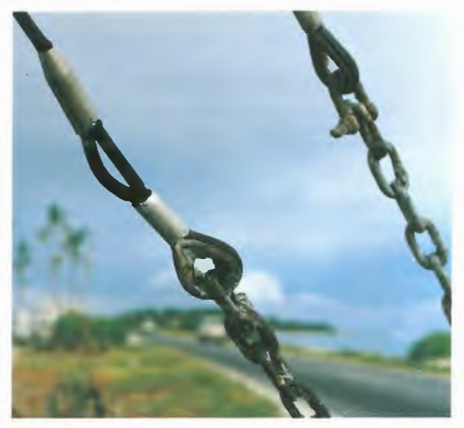
Rusted guy fittings.