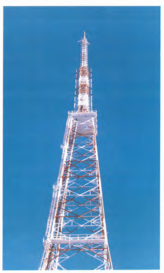
Mt. Cenn-Cruaich tower and antenna systems.

Principal features of the 1 MVA plant which was supplied by an Adelaide firm include a Cummins, Model KTA50G3