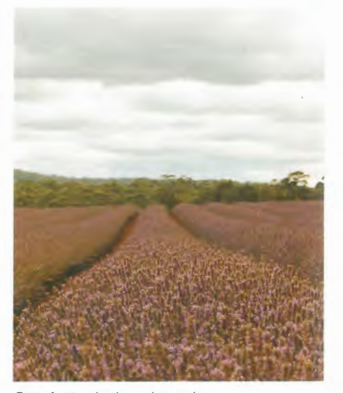
Part of extensive lavender gardens.