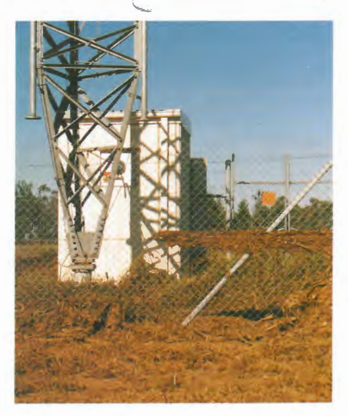
Debris indicating level of flood waters at 4CH mast base.