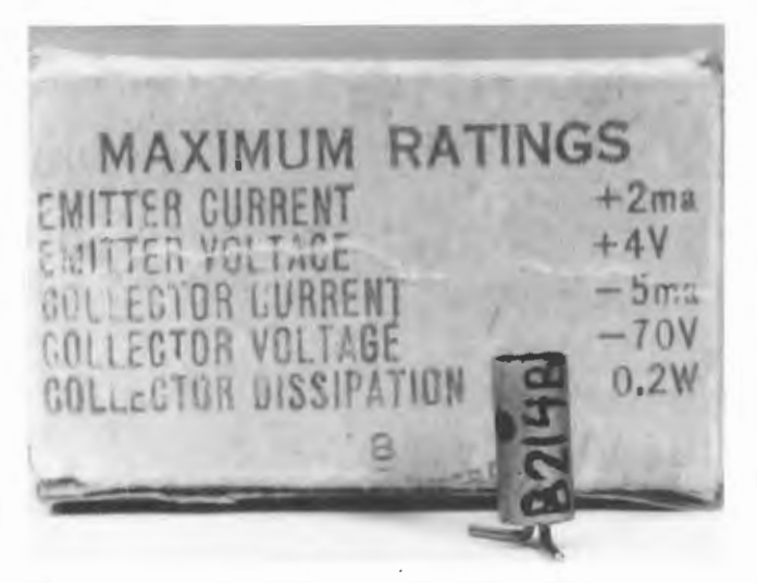
The transistor and maximum operating data.

The scientists had been studying the surface properties of germanium semiconductor rectifiers and during these studies noted that the conduction properties of a semiconductor diode could be controlled by an additional electrode attached to the semiconductor. This simple phenomenon resulted in what was later known as the point contact transistor. In terms of the original experiment, the