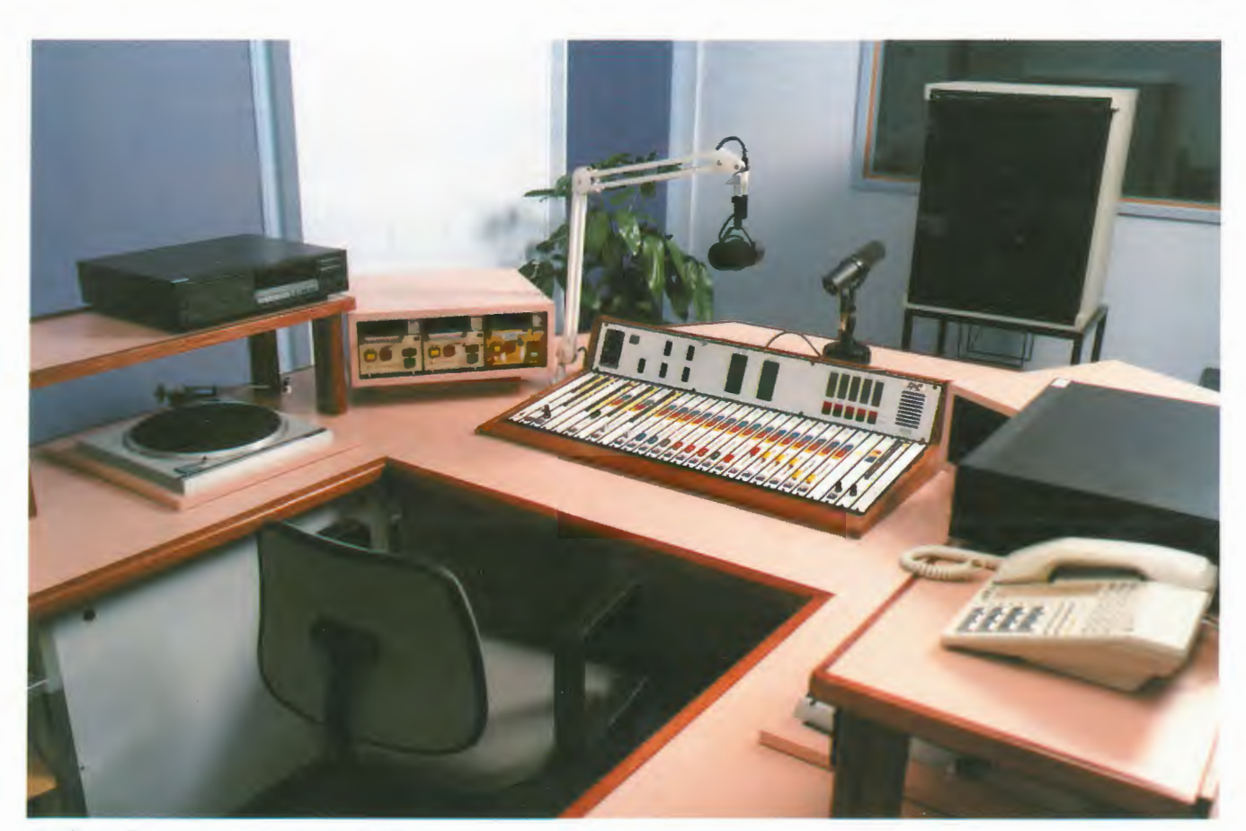
2NC studio announcers desk 1990.