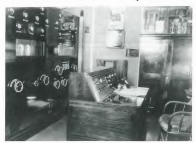
Original 4RK 2kW transmitter and control desk.

Station 4RK is located at Gracemere, 10 km out from Rockhampton. It was the first Regional station to be installed in Queensland after the Postmaster General's Department acquired 4QG in Brisbane as part of the establishment of the National Broadcasting Service.