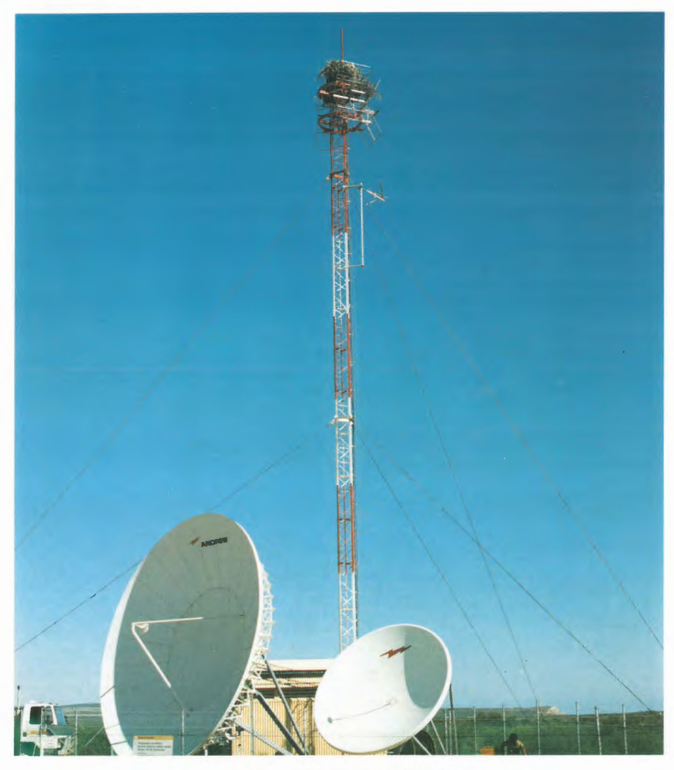
SEA EAGLE NEST IN ANTENNA