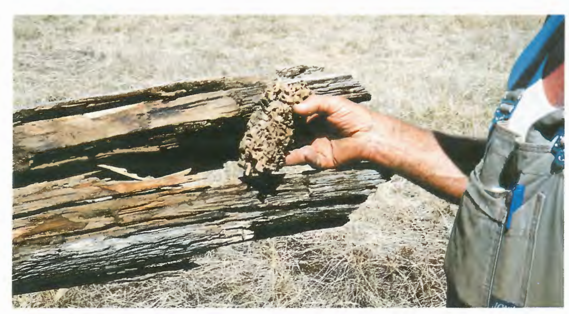
Termite damage to transmission line pole Radio Australia, Shepparton.