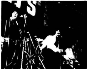
THE JUBILANT GROOP PLAY WILD VICTORY BRACKET