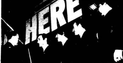
2nd PLACE GETTERS, THE QUESTIONS, FROM QUEENSLAND