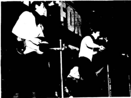
THE FLAMINGOES, FROM BRISBANE, 3rd PLACE WINNERS

The lead singer's performance of the Questions, is the best I have heard by a white singer to compare with the Black Soul Singers of America.