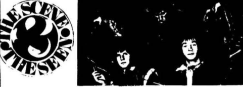
A quiet moment