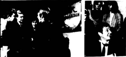
City Union boys convince Garrison executives that Friday lunchtime's Garrison "Dinner-lunch" is a winner!