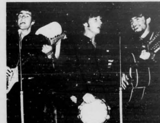
● The well-known Twilights from Perth give a swinging show at Adelaide's 20 Plus.