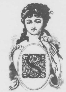
Prince Albert George Sebastian II