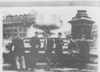
TWILIGHTS SEEN IN LONDON BY PASSING PIGEON AT TRAFALGAR SQUARE

Many people reading this column at the moment will have already seen the Big Show, but here in Melbourne we have to wait till next Thursday and Friday nights. Judging by previous reaction to Roy Orbison the crowd for a start will be very Pro Orbison, but although the Walker Bros have only had a handful of records here, I'm sure they will remedy this situation quickly. (How could three handsome men like John, Scott and Gary fail to please the female fans). Surprise of the year could be the Yardbirds. Their act will be either hot or erratic!