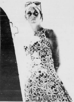
Pink print Culotte with rippled hemline. Orange ochre background with bright pink and purple with white shapes on top. Finished off with panel of bright pink buttons and neck and sleeve trim.

P.S. — I have had a few enquiries about where to buy the Ben garments featured in the last two fashion pages. In Melbourne they are available at Myers, Sportgirl, Bobbi's Boutique and Tomboy Taver. Other States: All leading stores.