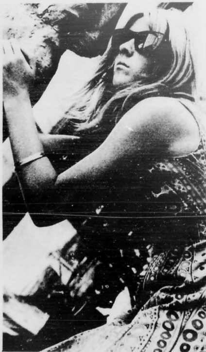
Mainly Browns in circle and line culotte with small cut-out at neckline. Colours: lime, orange, brown and white.

By Geoff Bado . . . courtesy "FIBREMAKERS" Photography: Colin Beard