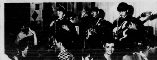
● The Dynamics at Long Johns (Sydney)