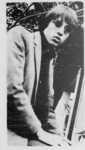
• Bee Gees