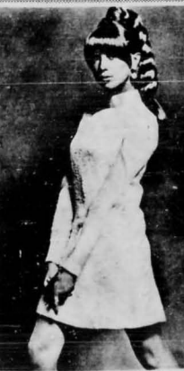
White cloque cocktail dress with high white satin stand-up collar and white satin bands on cuffs and hem and sides.