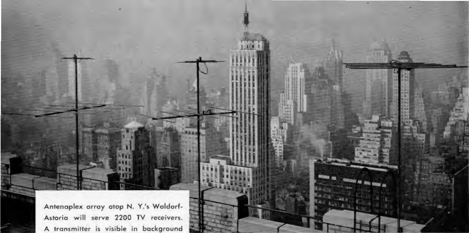
Antenaplex array atop N. Y.'s Waldorf-Astoria will serve 2200 TV receivers. A transmitter is visible in background