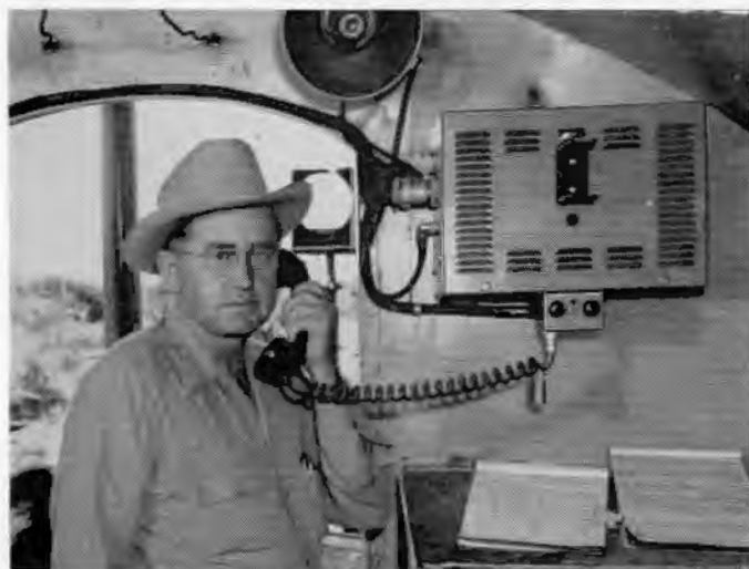
Mobile unit modified for fixed-station operation