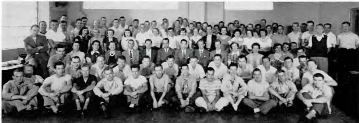
MEET the Flushing winners, folks. They came from way behind to topple Franklin Square, Bronx, and Sheepshead Bay

A LTHOUGH the heavyweight Flushing branch had lots of technical problems, it wasn't any of these which was the highest hurdle. It was the heavy competition of the other big Beam Benders.