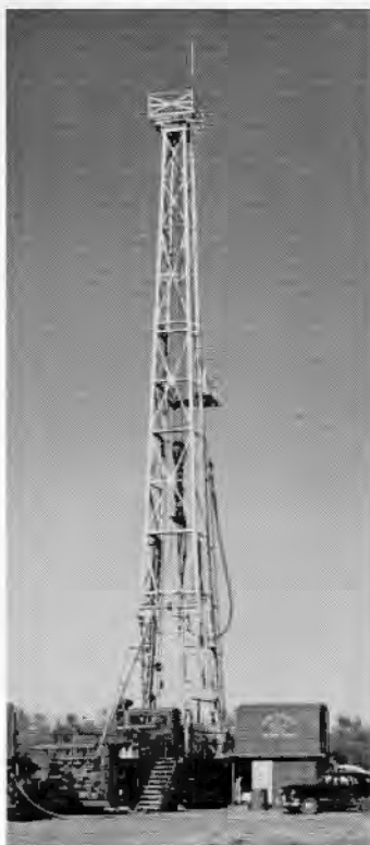
Mobile Fixed-Station Antenna atop Texas Drilling Rig

M OBILE AND MICROWAVE communications equipment is a lode that so far has been only tapped for pay dirt. Its growing use in the pipeline and taxi industries and on turnpikes should prove a service bonanza.