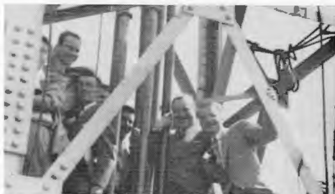
Toppers an top with top antenna atop Empire State Bldg.