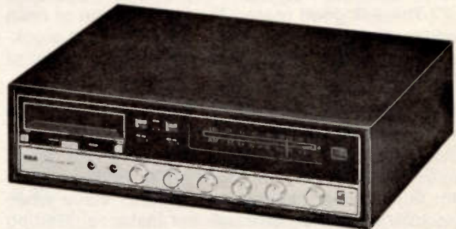
Figure 4—Model YZD 573

Figure-3 shows the simple circuit used for this function. A solenoid (S.D.C.) ejects the cassette when energized by the conduction of transistor Q14. Tape-motion-sensing switch S14 is part of the tape-supply spindle. When the tape is moving, the moveable wiper of S14 alternately closes the contacts of the switch—much like the brushes and commutator of a DC motor. When the tape motion stops, switch S14 can be open or touching either contact. When the tape is moving, transistor Q13 conducts because increased base current is available. The base current for Q13 serves as charging current for capacitor C208. Capacitor C208 never reaches a full charge because the tape-motion sensing switch (S14) alternately connects C209 across C208 and then discharges it. This action assures continuous base bias for Q13 while the tape is in motion. When the tape stops, S14 no longer cycles and C208 assumes full charge. With C208 fully charged, Q13 has no base