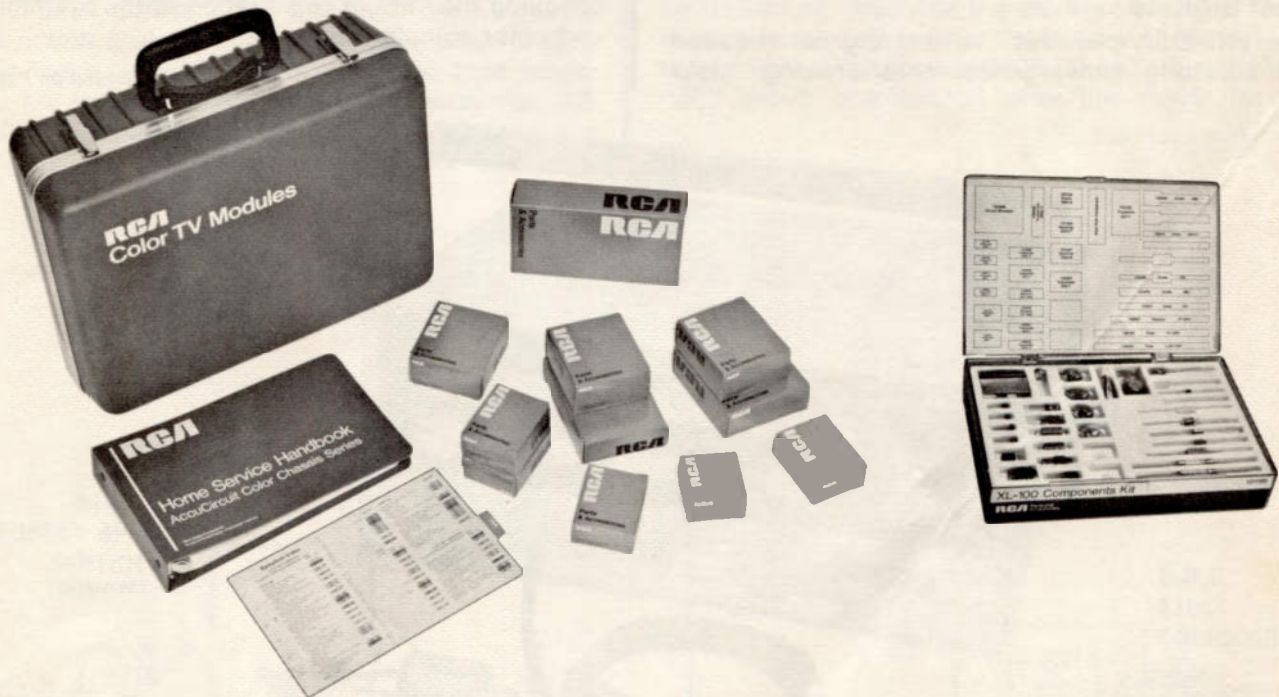
Figure 1—XL-100 Service Aids

Additional XL-100 service aids are the Service Data and Technical Training Programs offered by RCA Consumer Electronics. If you are not participating in the training workshops or wish to renew your Service Data subscription, see your RCA Consumer Electronics Distributor today.