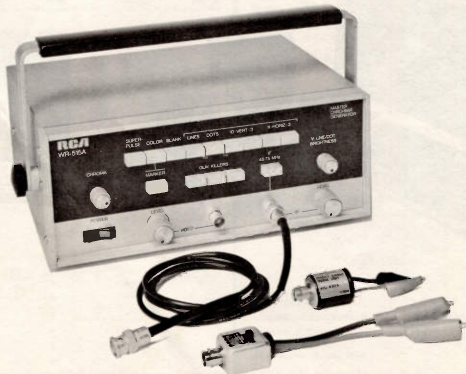
Figure 2—WR-515A Master Chro-Bar/Signalyst