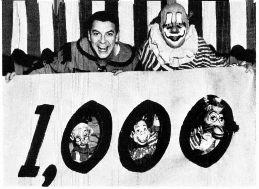
BOB SMITH, CLARABELL AND THE HOWDY DOODY CAST POSE FOR ANNIVERSARY PHOTO

Befitting the occasion, Bob Smith made an announcement. A new charity, KIDS' CARE, had just been formed, and Howdy