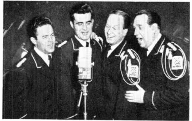
GREEN AND WHITE Quartet has been with Cities Service for almost a decade. They have a new RCA Victor album called "Just a Song at Twilight." It contains the title song, "Sylvia," "Trees," "Mah Lindy Lou," "Spirit Flower" and four others.