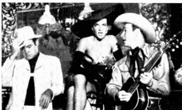
SON OF PALEFACE opens with Bob Hope playing the son of the character he portrayed in "Paleface." In this Technicolor sequel Roy Rogers joins Hope and Jane Russell in the cast. Roy has recorded two of the tunes he sings in the film. The new RCA Victor disc has "There's a Cloud in My Valley of Sunshine" and "A Four Legged Friend."