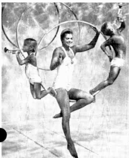
SKIRTS AHOY is all about the WAVES. Esther Williams, as a rich society girl, meets Joan Evans and Vivian Blaine at the Great Lakes Naval Training Station. She also encounters the De Marco Sisters there. Male members of the M-G-M cast include Barry Sullivan (who plays opposite Esther) and Keefe Brasselle.