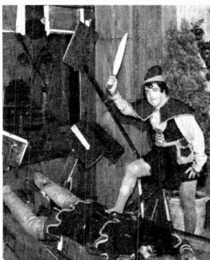
JACK AND THE "Beanstalk" finds Bud Abbott and Lou Costello in their first Technicolor movie. The giant is played by Buddy Baer. Paul Winchell and Jerry Mahoney have recorded the new title tune from the movie, and Wayne King has a recording of "Dreamer's Cloth" from the new Warner Brothers motion picture.