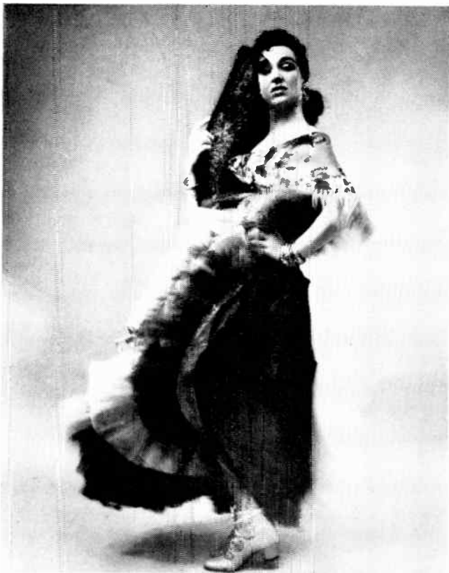
AS CARMEN RISÉ STEVENS SWIRLS ABOUT ON THE MET STAGE