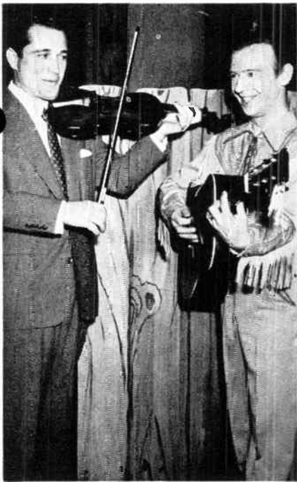
GUEST Hank Snow gets a gentle ribbing from Perry Como during a rehearsal of Como's Mon., Wed., Fri. television program for Chesterfield. Just out is an album of Perry's "T.V. Favorites." It contains "You'll Never Walk Alone," "Over the Rainbow," "Black Moonlight," "I Concentrate on You," "My Heart Stood Still," "Summertime" and two others. Hank Snow's latest disc is "I Just Telephone Upstairs."