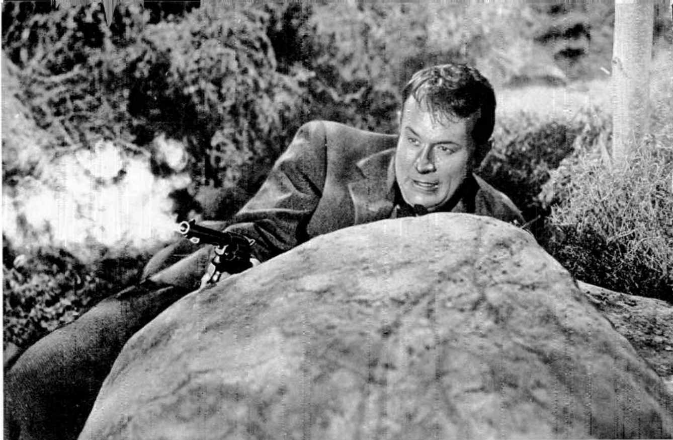
IN APPROVED COWBOY FASHION VAUGHN MONROE CROUCHES BEHIND A BOULDER AND BLAZES AWAY AT THE ENEMY