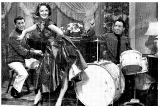
ABOUT FACE gives Gordon MacRae his first screen opportunity at comedy; it also gives Eddie Bracken chance to sing several songs. Featured in the Technicolor film are Dick Wesson, Virginia Gibson and Phyllis Kirk. Setting for the movie is a military academy. Nine new songs for the score were written by Charles Tobias and Peter De Rose.