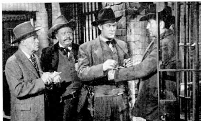
EDGAR BUCHANAN , second from left, watches Monroe as Vaughn commits villain Victor Jory to the pokey. "Lady Love," which Monroe has recorded, is from "Sound Off," a new Mickey Rooney film.