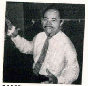
PÉREZ PRADO performs "Mambo No. 5," "Mambo No. 8." "Oh Caballo," "Pianolo," plus two others on disc.