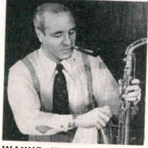
WAYNE KING plays "The Blue Danube," "Wine, Woman and Song," "Tales from the Vienna Woods" and 2 more,