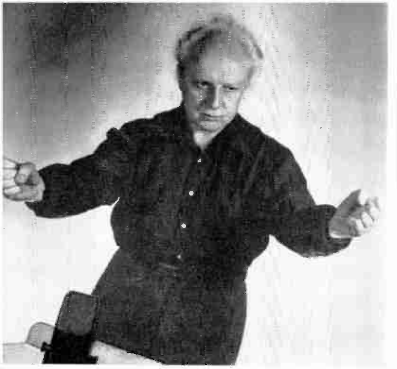
LEOPOLD STOKOWSKI IS TRAVELING THROUGH U.S. AND EUROPE