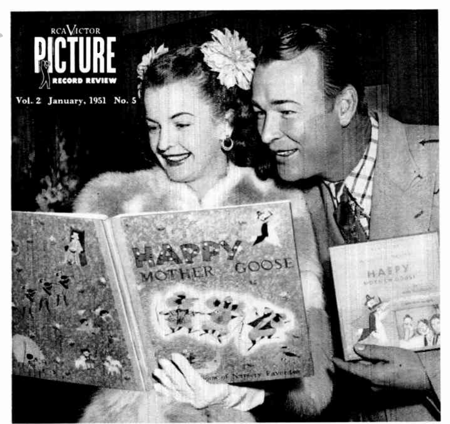
DALE & ROY Rogers take a look at "Happy Mother Goose," the new book of modernized nursery rhymes on which Burr Tillstrom has based his recently issued Kukla, Fran and Ollie album, "Happy Mother Goose." The Rogers have just wound up a highly successful rodeo tour. (Their latest disc; "No Bed of Roses.")