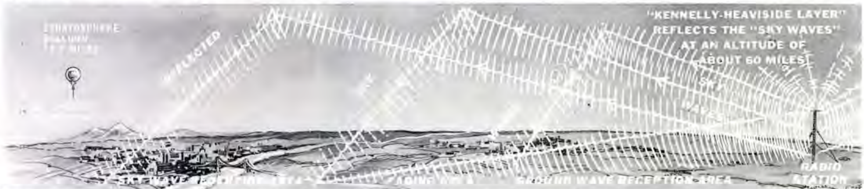
DIAGRAM ABOVE SHOWS HOW GROUND WAVES AND SKY WAVES EACH HAVE AREAS OF GOOD RECEPTION. RCA AND NBC ENGINEERS DESIGN AND OPERATE NBC STATIONS TO PREVENT OVERLAPPING OF THESE WAVES AS FAR AS POSSIBLE.