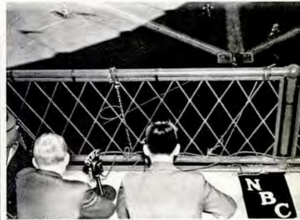
NBC BRINGS YOU BASEBALL!

Summertime is sports time. Through the activities of NBC the thrills of sports events are yours every day. Above is famed sports announcer Clem McCarthy telling radio listeners about an exciting moment in a famous horse race. NBC's many able sports commentators bring you on-the-spot accounts of the leading sporting events, summer and winter!