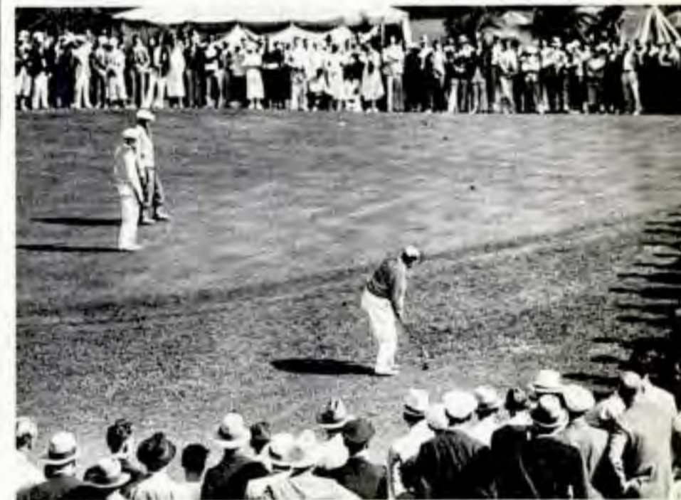
NBC TELLS YOU ABOUT GOLF!