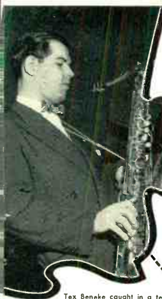
Tex Beneke caught in a tense moment during recording session for his latest hit, just released "Dream Girl."