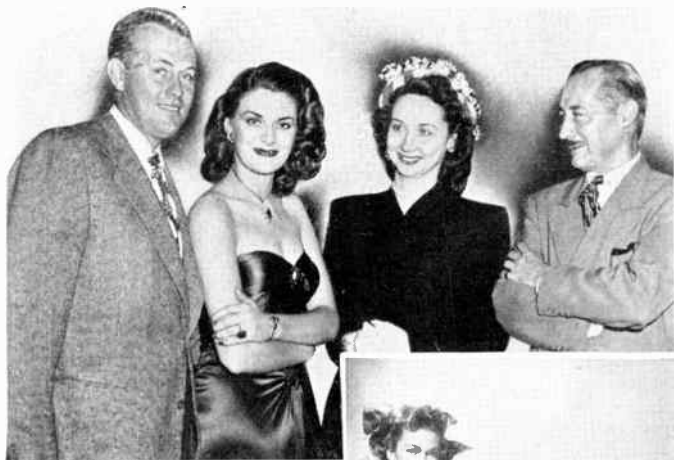
Above, Vaughn Monroe and the alluring Beryl Davis pose cheerfully with Dorothy Kilgallen and Danton Walker at a recent rehearsal for Vaughn's Saturday night Camel radio show.

Smash Hits from Broadway Shows is the pick of the crop for listenable and danceable enjoyment.