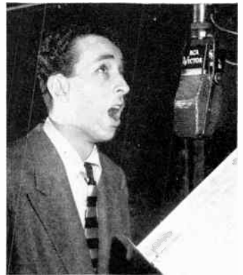
If You'll Be Mine