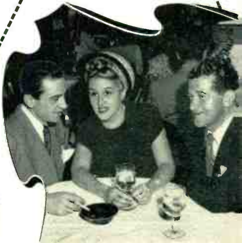
Relaxing in style are, left to right: Boyd Raeburn, Margaret Whiting and Eddy Howard.